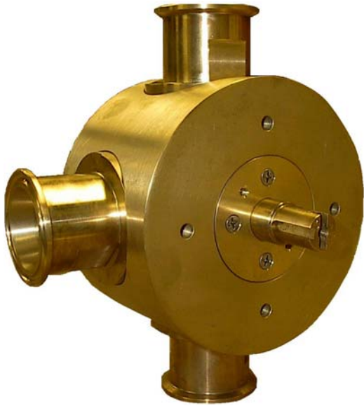
BLENDER ONLY (FRONT VIEW)